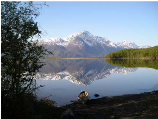
Mud Lake, Knik Public Use Area (Frankie Barker, MSB)

The Matanuska-Susitna Borough's natural environment, with its abundant supplies of clean water, its beauty, and its other natural resources, has attracted people to our community for generations. Natural systems serve many essential biological, hydrological, and geological functions that significantly affect life and property in the Borough. Features such as lakes, wetlands, streams and rivers provide habitat for fish and wildlife, flood control, and groundwater recharge, as well as surface and groundwater transport, storage, and filtering. Vegetation, too, is essential to fish and wildlife habitat, and also helps to support soil stability, prevents erosion, and absorbs significant amounts of water, thereby reducing runoff and flooding. A well-functioning natural environment also provides clean air, which is becoming a growing concern as the Borough continues to develop. In addition to these functions, the natural environment provides many valuable amenities such as scenic landscape, community identity, open space, and opportunities for recreation, culture, and education.