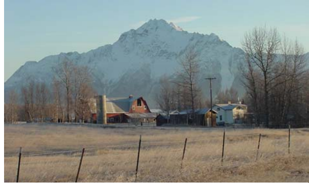
Trunk Road Farm (Sandra Petal, MSB)

Currently, the Borough maintains a large number and diversity of parks, campgrounds and recreational areas. As the Borough's population continues to grow, the demand for various year-round passive and active recreational opportunities increases. The Borough should accommodate such demand with the following goals and recommendations: