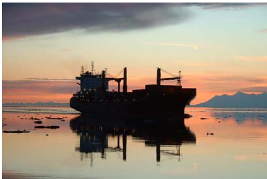
Vessel Bound for Port MacKenzie (MSB)

The Borough's economy has dramatically changed since 1970. The economy has changed from an agricultural based economy to one that largely consists of tourism, retail sales, and service activities. The Borough's economic maturation process continues to diversify consistent with population growth. For instance, the Borough has recently seen new development in the health care industry bringing new economic and employment opportunities to local businesses and residents.