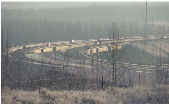
Parks and Glenn Highway Interchange

The Borough adopted its first regional transportation plan in 1984 which was later updated with the adoption of the 1997 Long Range Transportation Plan. Each of these plans recognized the need for the development of a regional network of highways and arterials to support the Borough's population and economic growth. The plans also recognized the