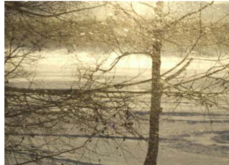
Windstorm, Wasilla Lake (Sandra Petal, MSB)

Borough residents may periodically be confronted by natural and human caused hazards. Potential natural hazards include floods, earthquakes, avalanches, wildfire, snow and windstorms and extreme cold. Human caused hazards include hazardous material and waste spills, railroad derailments, and air and water contamination. It is vital for the Borough and its residents to be adequately prepared to respond to these hazards in order to reduce the loss of life and property. Moreover, it is necessary to have prepared action plans for community and economic recovery so that our community may begin a timely rebuilding/recovery process. To adequately address natural and human caused hazards, the following goals and recommendations are made: