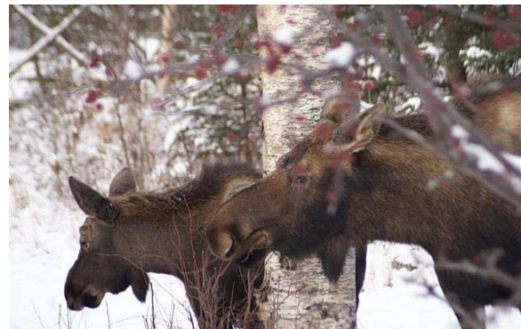
Two Moose

The Borough has hundreds of lakes, streams and rivers that provide valuable habitat for fish and wildlife, contribute to water quality and provide recreational opportunities for residents and visitors. Open space corridors serve many important functions, including recreation, fish and wildlife habitat, and the connection of individual features that comprise a natural system. For example, the "Crevasse Moraine" area in the Borough's Core Area provides such functions.