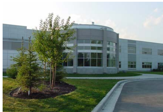
Teeland Middle School (MSB)

Public facilities include schools, fire stations, libraries, parks, water and sewer systems, landfills, and recreational structures. These facilities are necessary to support community development and growth by supporting the provision of clean water, emergency response, education, recreation, and other vital community services. Public facilities are therefore a necessary ingredient in enhancing the borough's quality of life. A community's public facility infrastructure also engenders a sense of community by providing physical features that may promote additional development activity and thus enhancing community quality. Successful economic development relies upon a comprehensive public facilities network. Potential investors must be assured of the availability of clean water supplies, efficient waste disposal services, fire protection, and quality education opportunities.